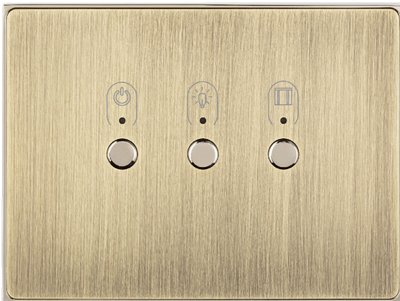
AXIA ITALIAN STANDARD

Just like all the other VDA collections, you can customize AXIA's icons through the owner ID, to have a unique smart switch with an inimitable style.